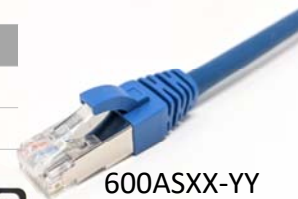
600ASXX-YY XX: FT YY: COLOR